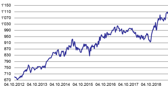
— H Infrastructure - Water Fund (EUR)