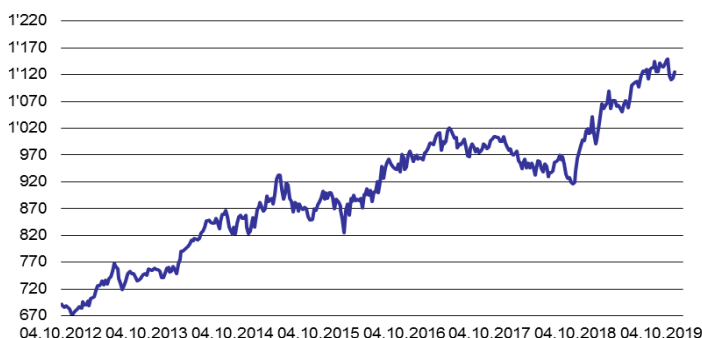
— H Infrastructure - Water Fund (EUR)