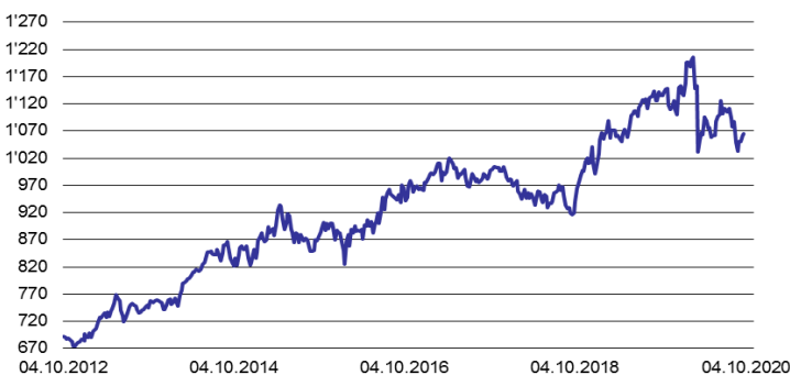
— H Infrastructure - Water Fund (EUR)