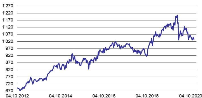
— H Infrastructure - Water Fund (EUR)